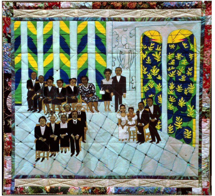
Image 10 Faith Ringgold (b. 1930). The French Collection #6 Matisse's Chapel (1991). Acrylic on canvas with pieced fabric border.

The reference to Henri Matisse is a powerful decision that Ringgold executes masterfully. Her careful recreation of a work within the Western canon is incorporated in recognition of the