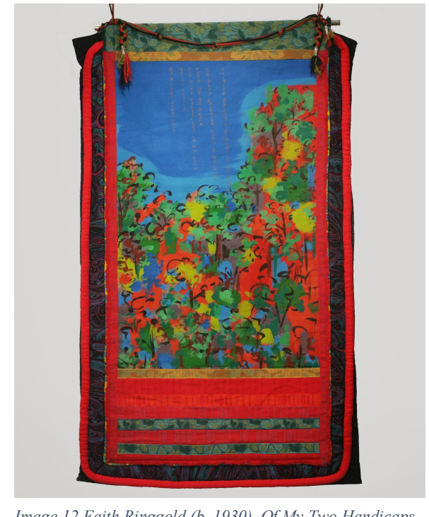
Image 12 Faith Ringgold (b. 1930). Of My Two Handicaps (1972/1993). Acrylic on canvas, framed in cloth.

African American congresswoman: "Of my two handicaps, being female put more obstacles in my path than being Black" (Graeber). A close look at the painting reveals that within a scene of a lush tree line in vibrant primary colors, the Chisholm quote is written out vertically in metallic text. Along the borders, intricately patterned bold cloth hides the subtlety of the written text. In this presentation of the quote, there is a further push for the viewer to look closely to fully grasp the positionality of Black women as they grapple with racism and sexism at once. While Blackness and womanhood co-exist in her everyday lived