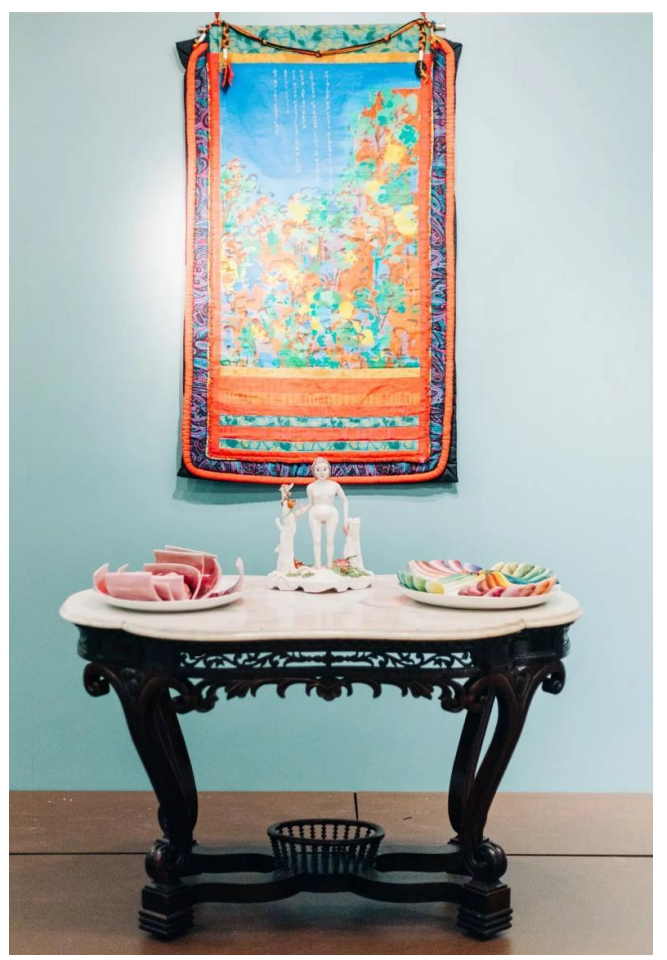
Image 11 On wall: Faith Ringgold (b. 1930) "Feminist Series: Of My Two Handicaps" (1972/1993). Acrylic on canvas, framed in cloth. On table: Judy Chicago (b. 1939). Prototype plates from "The Dinner Party": "Virginia Woolf" and "Elizabeth Blackwell" (1974-79). Ceramic and porcelain.

As one of Ringgold's contemporaries, Judy Chicago, enjoys recognition and acclaim at a level most artists, let alone women artists, ever accomplish in their lifetimes. From May 26 to