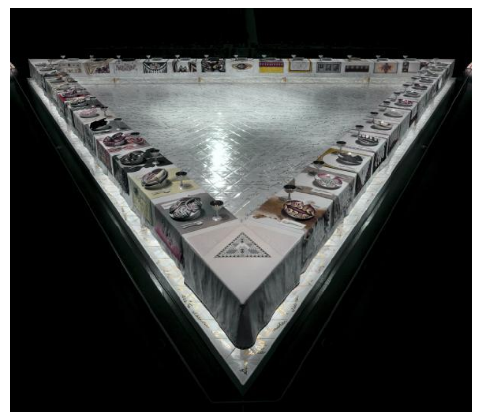
Image 13 Judy Chicago (b. 1939). The Dinner Party (1974-79). Ceramic, porcelain and textile.

in interpersonal dynamics, politics, and the workforce (Burkett). In stark contrast to this work is Faith Ringgold's 1993 book Dinner at Aunt Connie's House . The story details the excitement of